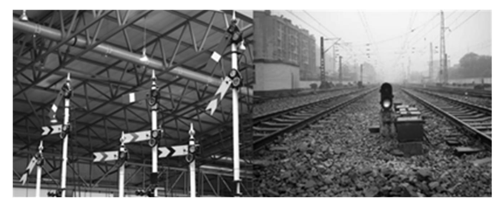
Fig. 1. Railway signal